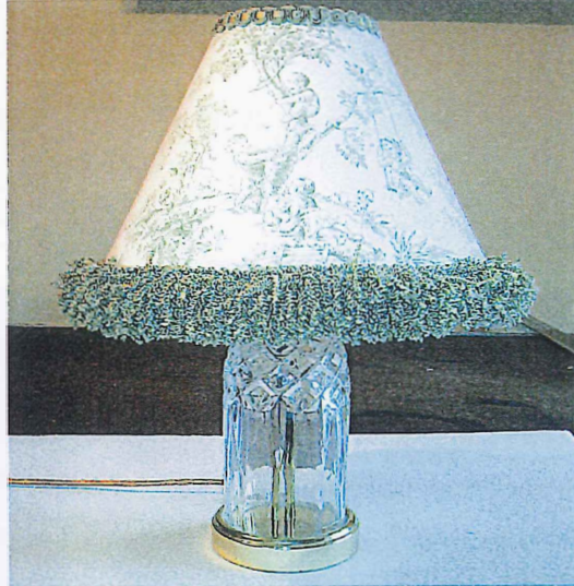
An add-on product you can make yourself.

out of a piece of face fabric and a piece of rayon lining. Bring the face fabrics, back seams together, and sew closed. Repeat with the lining. Place the cone