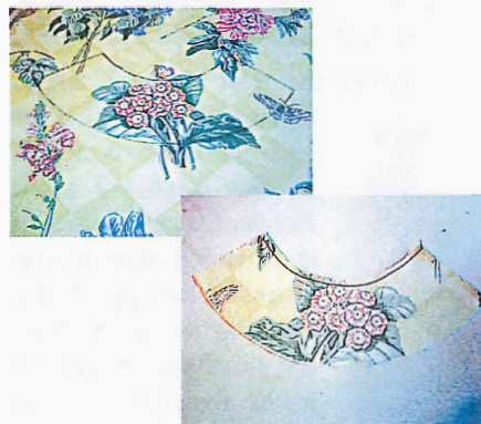
Illustrations 3 & 4

out of a piece of face fabric and a piece of rayon lining. Bring the face fabrics, back seams together, and sew closed. Repeat with the lining. Place the cone