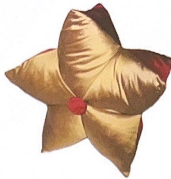
*- Points of star