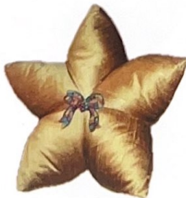
This pillow looks great with a simple bow embellishment. It can also be personalized as a mother's pillow by embroidering her name and her children's names on the points.