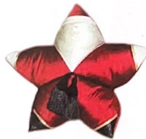
This pillow makes a wonderful Santa. He is complete with faux leather "boots," chenille "mittens," and a hat band.